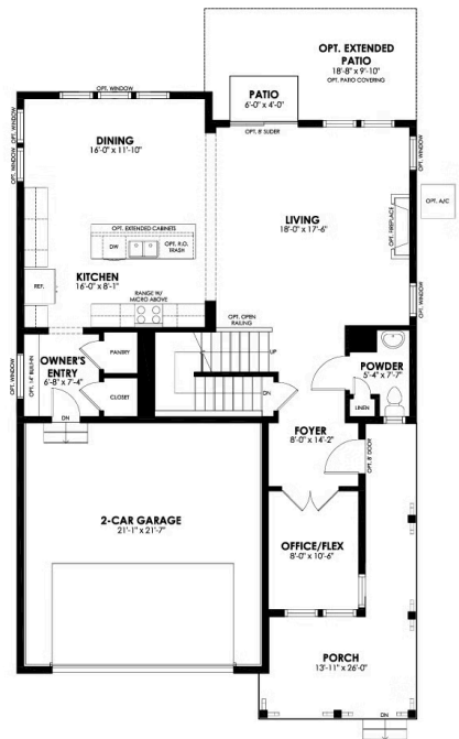
TWAIN - FIRST LEVEL

CALL 970-716-6088 TO SCHEDULE A 1 ON 1 APPOINTMENT