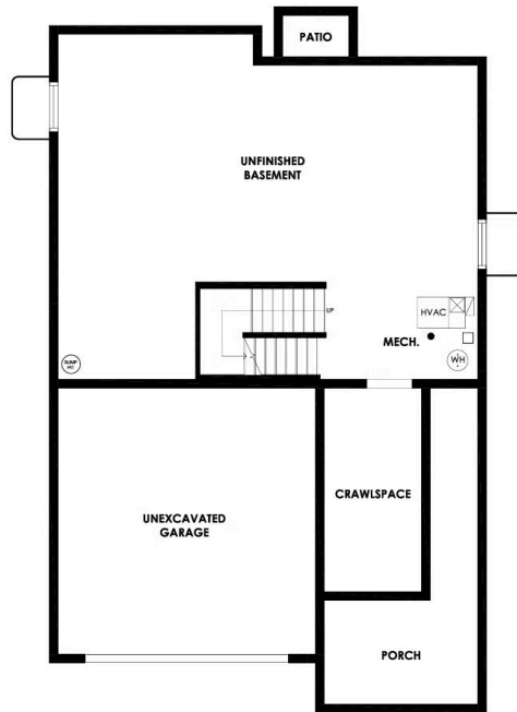
TWAIN - UNFINISHED BASEMENT

CALL 970-716-6088 TO SCHEDULE A 1 ON 1 APPOINTMENT