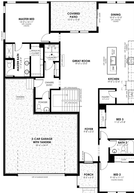
MORRISON - FIRST LEVEL FARMHOUSE

CALL 970-716-6088 TO SCHEDULE A 1 ON 1 APPOINTMENT