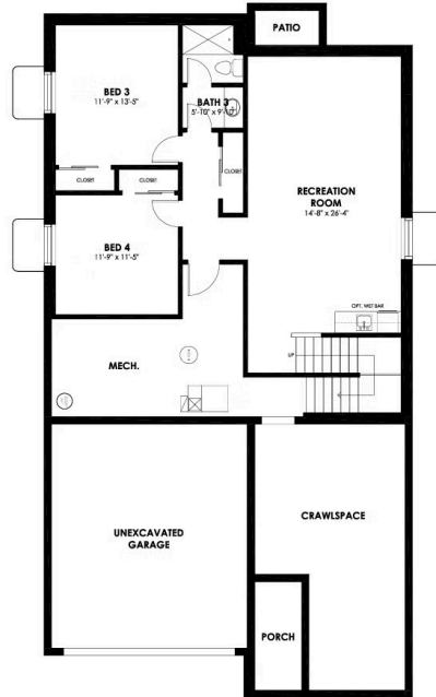
CHRISTIE - FINISHED BASEMENT

CALL 970-716-6088 TO SCHEDULE A 1 ON 1 APPOINTMENT