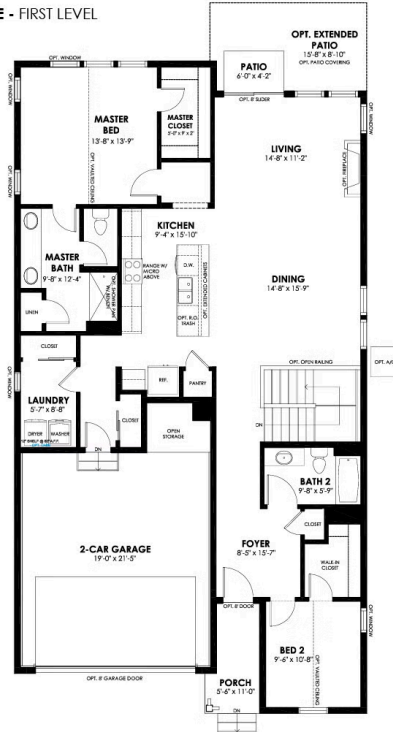
CHRISTIE - FIRST LEVEL

CALL 970-716-6088 TO SCHEDULE A 1 ON 1 APPOINTMENT