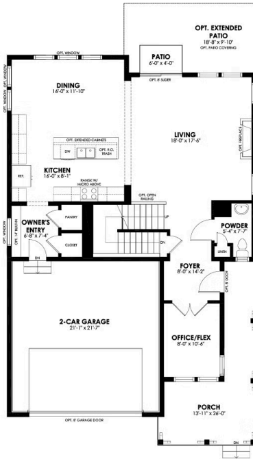
TWAIN - FIRST LEVEL

CALL 970-716-6088 TO SCHEDULE A 1 ON 1 APPOINTMENT