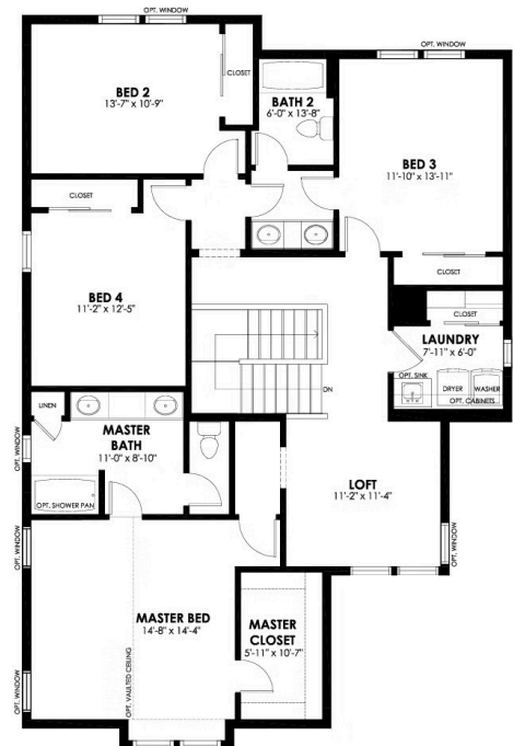
TWAIN - SECOND LEVEL

CALL 970-716-6088 TO SCHEDULE A 1 ON 1 APPOINTMENT