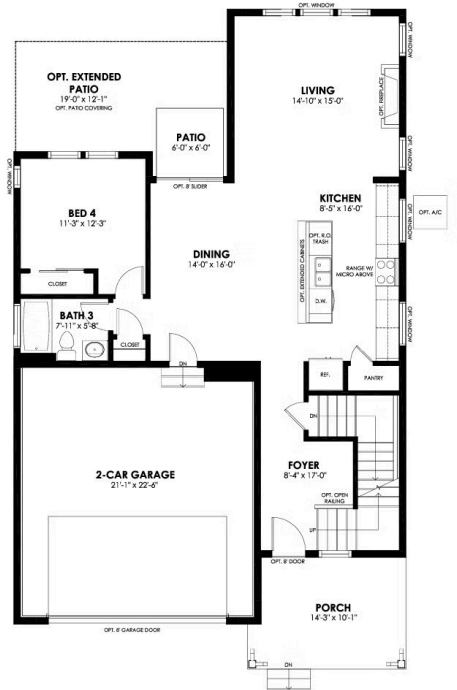
ROWLING - FIRST LEVEL

CALL 970-716-6088 TO SCHEDULE A 1 ON 1 APPOINTMENT