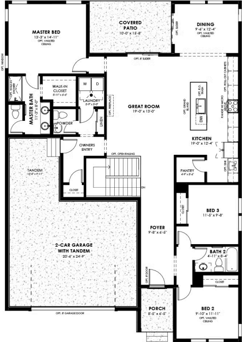
MORRISON - FIRST LEVEL FARMHOUSE

CALL 970-716-6088 TO SCHEDULE A 1 ON 1 APPOINTMENT