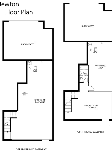
Newton Floor Plan

All measurements are approximate and not guaranteed. Illustration provided for marketing and convenience only and is not part of a legally binding contract.